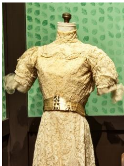
Pictured is Olivia Burr Hillard Conyngham's wedding gown from 1864.

The Weddings and Courtship Exhibit will focus on traditions from the 18 th century to the present and include wedding gowns and accessories from the Society's extensive collection. Come learn about the changes in the rituals of marriage and courtship through time. The exhibit will be on display September 26, 2014 through January 2015.