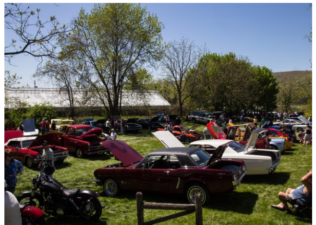
Scene at a previous year's car show

The Luzerne County Historical Society will hold its Sixth Annual Classic Car Show from 9 am to 3:30 pm, on Sunday, May 1, on the grounds of the Historic Swetland Homestead at 885 Wyoming Avenue, Wyoming. The show will be open to any vehicle: classic cars, race cars, muscle cars, tuners, trucks, motorcycles, choppers, bicycles, etc. If it has wheels, we want it! Entry fee is $15.00 per vehicle and free for spectators. All proceeds will benefit the LCHS and the Homestead. The show will feature DJ Steel Dragon, a 50/50 drawing, raffle prizes, and some great food. The Swetland Homestead will be open for tours for an additional fee. Registration is from 9 am to noon. Judging will take place from 12:30 to 2:30 pm. Trophies will be awarded at 3 pm to the Top 30 entries as well as Best of Show and People's Choice. Dash Plaques and goody bags will be given to the first 100 entries. Don't miss one of the biggest events of the season. Last year over 160 cars graced the Swetland lawns! Rain Date will be May 15. Preregistration is encouraged but not required. For more information, or to pre-register a car, call 570-823-6244 ext.3