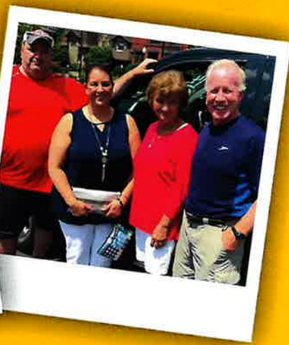
Scenes from last year's Road Rally

More information will be forthcoming; check our website and Facebook page.