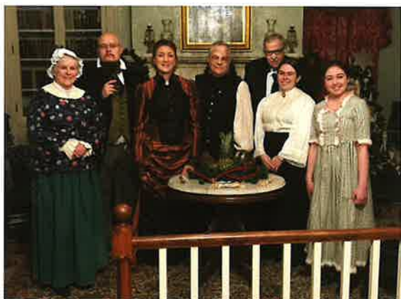
LCHS volunteers in character for Festive Traditions at the Swetland Homestead, December 1-2, 2018.