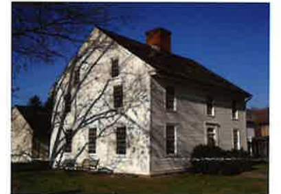
Exhibit opening, Battle of Wyoming at 240: Revolution on the Homefront, Museum. 5:30-7:30 p.m. FREE to all.